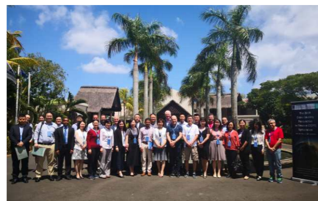
2019 Cross Country Perspectives in Finance Conference