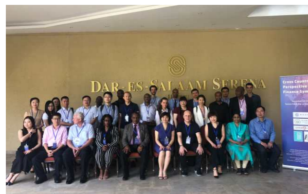
2018 Cross Country Perspectives in Finance Conference